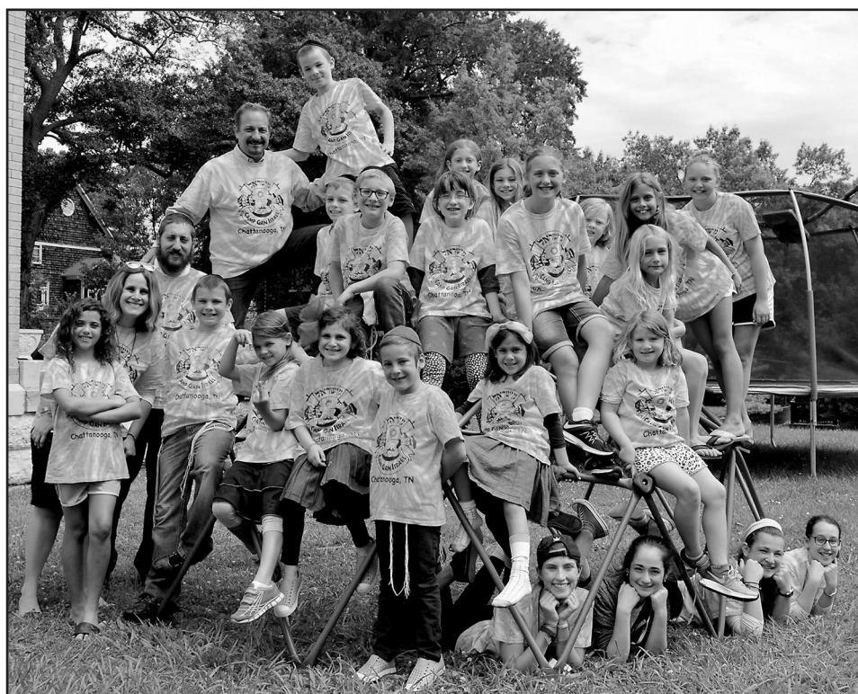
Gan Israel Campers, Summer 2017