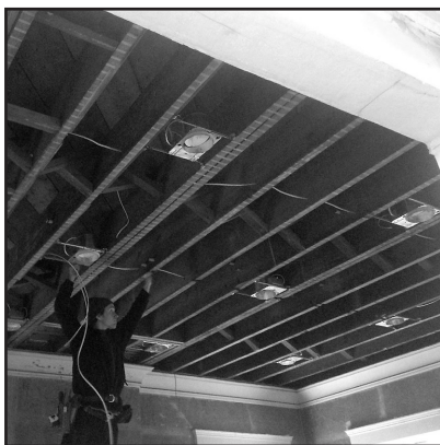
Electricians wiring for new lights

This is just some of the progress over the last couple of months. We are getting close to completion!