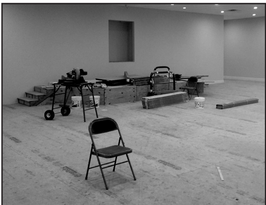
Finishing the stage in the shul