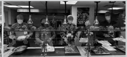
Volunteers serving lunch at Erlanger