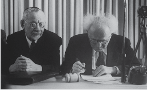
David Ben-Gurion signs Declaration of Independence during a ceremony at the Tel Aviv Museum. Sitting beside him: Rabbi Yehuda Leib Maimon, May 14, 1948.