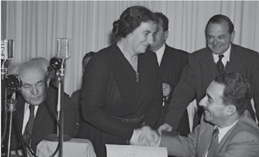
Golda Meir and David Ben-Gurion during the signing of the Declaration of Independence at the Tel Aviv Museum, May 14, 1948.