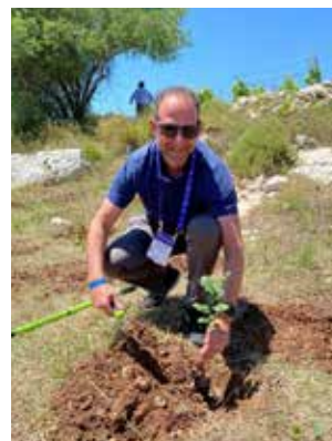
Rob Lowe in Neot Kedumim nature park planting a tree in honor of Israel's 75th anniversary