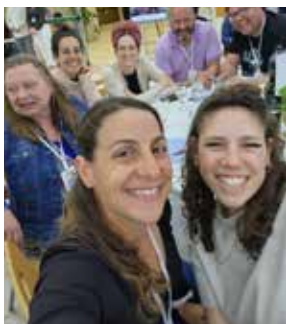
Opening P2G anniversary event in Hadera.